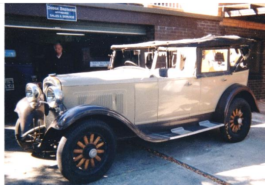
When purchased by Doc in 1999