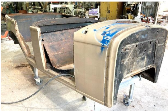
Body removed and ready for paint stripping & repair