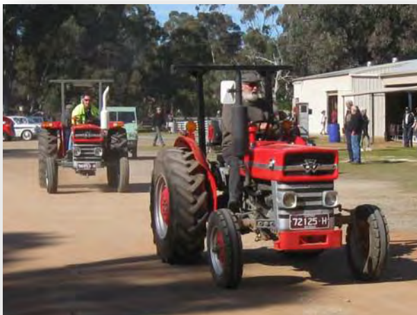
The event included a tractor treks to a small local town. Here two similar Massey-Ferguson MF135s of the 1970s tail the convoy to Wychitella

Although most of the engines and vehicles the club owns are pulled out of the sheds for display there are several others in the sheds. I have been working on a Lister LP3 diesel marine engine. I had started work on a less complete LP3 when this engine was offered to the club. The engine is in very good condition inside and cleaning and painting 'mid-Brunswick green' has been the main activity. I would like to talk to anyone who is an expert on these engines as the injectors need setting up and other advice is needed to assemble it. A water pump is missing and any good parts are sought for the other LP3.