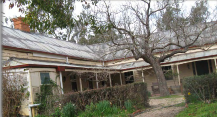
Tottington homestead, Glen Haldon talks outside the old woolshed