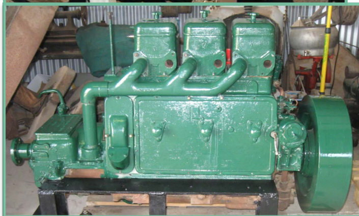
Lister LP3 diesel marine engine. Advice is sought to help the restoration

vintage Model Ts. His latest project has just been completed, a splendid 1923 Model T wagonette with bench seating in the back.