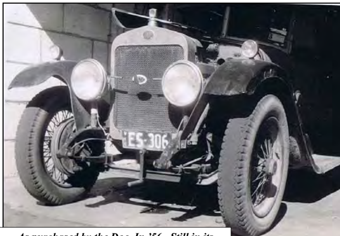
As purchased by the Doc. In '56. Still in its original green. The driver's side spare wheel has been removed.