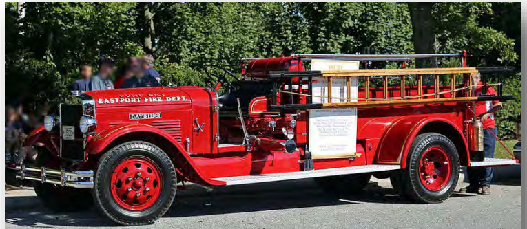
1931 Day-Elder pumper with Peter Pirsch body and fire fighting equipment, belonging to the Eastport Fire Department (Long Island, NY) on a parade at the Southampton LIRR station. This vehicle was the first one belonging to the EPFD and was restored in 2013 to celebrate the centenary of their establishment.

D.E. introduced a six-cylinder range (dubbed the "Super Service Sixes") in July 1930. This range, comprising eleven models, had fully enclosed "all-weather" cabins and chrome exterior fittings. In order to better compete with other manufacturers who were strong in D.E.'s home area, they then added heavier trucks of up to 8 tonnes in 1930, and engines from Hercules and others were also made available. None of this sufficed however and Day-Elder ended up shutting its doors in 1937, as they could not weather the Great Depression