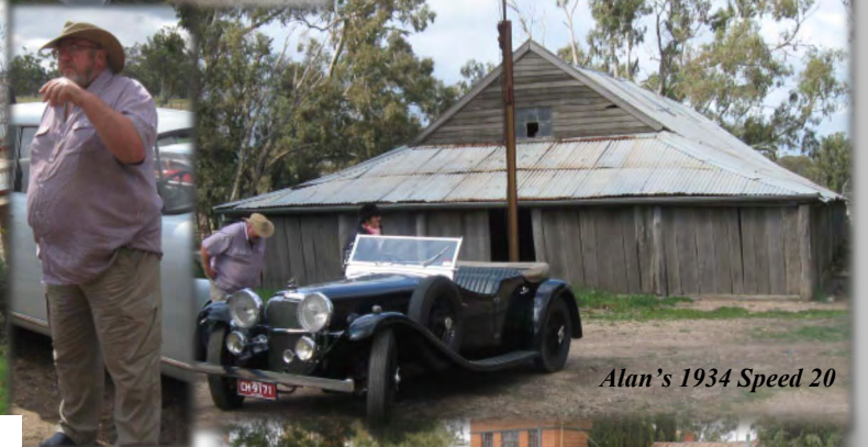
Alan's 1934 Speed 20