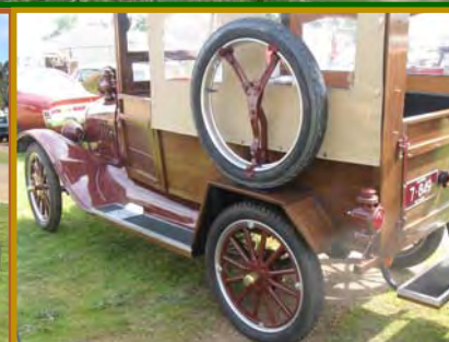
Bernie Maddox's newly restored Model T Ford Depot Hack or antique station wagon (the registration shows)