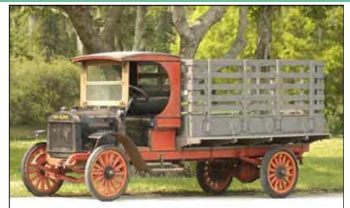
On the web this rare 1918 Day Elder Model B Stake Truck was advertised for sale in 2007 (USA) which is very similar to the club's model

It has a Buda engine Model WTU, BM 2458 Serial no: 114804A. Specifications: 22.5hp, inline four-cylinder engine, manual transmission, four-wheel semi-elliptic leaf spring suspension, and mechanical rear brakes. Wheelbase: 144" With a load capacity of approximately 1½ tons, the Model B was one of Day-Elder's more capable line of utility trucks.