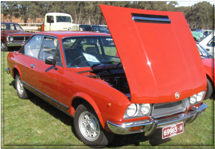
1974 FIAT 124CC Sport Coupe