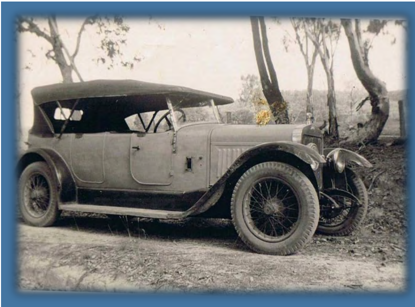
On a country Victorian road in its new coat of blue. Another interesting caption in the Donnan family photo album states... "The final days of the Delage – getting more and more expensive to maintain and now leaking oil on both sides of the front of the engine." With statements like this one wonders whether one has done the right thing! Note the rear passenger door is a false one.