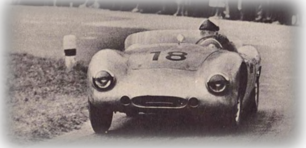
1957 Borgward Rennsport at Salzburg-Gaisberg Hill Climb

Borgward made a number of sports/racing cars derived from their family saloons. The standard 1949 Hansa had a 1½ litre 52bhp ohv engine. Power was increased to 66bhp in a special built for record breaking at Monthéry in 1950. It was the basis of the Rennsport coupes and open two-seaters that were fielded in German events from 1952-1955. For 1956 it had a twin-cam engine giving 130bhp, tubular frame and De Dion rear axle. They achieved no striking victories but came 2nd in the German Sports Car Championship and German Hill Climb Championship in 1958, being defeated by Porsche in each case. No Borgward sports cars were sold to the public. Lessons of racing were applied in the 75bhp TS version of the Borgward Isabelle saloon and there was an attractively-styled three seater sports coupe.