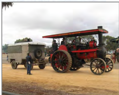
1909 John Fowler B5/B6 8nhp shown by Scobie Bros towing a night cart