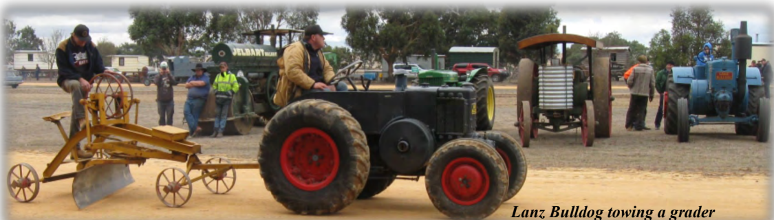
Lanz Bulldog towing a grader

The featured tractors were displayed then later lapped the oval. The most common being the semi-diesel Lanz Bulldog and similar but different Field Marshalls. It is little wonder that most old farmers loose their hearing having to endure hours and hours ploughing their paddocks behind the wheel of a noisy thumping one cylinder tractor. The German Lanz engine was reputed to burn anything included used engine and gearbox oil thinned with paraffin. One can imagine the amount CO2 pollution that would have belched through their exhaust! Hopefully the farmer was not driving against the wind. It goes without saying farming has always been a hazardous occupation.