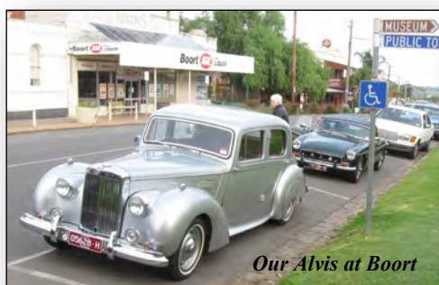
Our Alvis at Boort